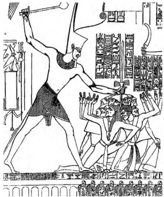
Figure 6. Relief of Seti I (13th c. BCE) with raised right hand, shattering the heads of his enemies, Hypostyle Hall at Karnak16

Victory through a "mighty arm." In addition to similar structure and story themes, Berman points to specific terms common in the two accounts but rare elsewhere in scripture. As one example, he points out the use of "mighty arm":17