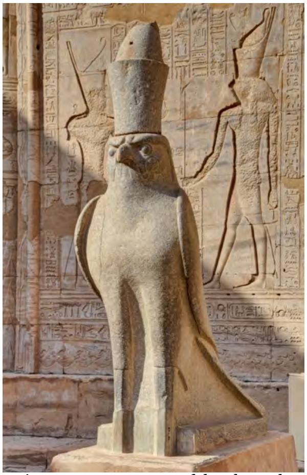
Figure 2. Falcon Representing Horus, protector of the pharaoh, at the Temple of Horus at Edfu. The pharaoh himself was also known as the "living" Horus, a god in his own right. Horus wears the pshent (double crown) representing the uniting of Upper and Lower Egypt.

What Was the Battle of Kadesh? The Battle of Kadesh (1274 BCE), fought between the Egyptians and the Hittites, is perhaps "the best documented battle in all of ancient history:"4