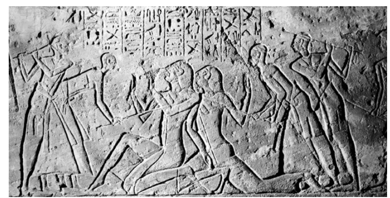
Figure 4. Shasu Spies Being Beaten by Egyptians for Falsely Reporting the Whereabouts of Hittite Troops.12 The image recalls the accusations of spying leveled by Joseph at his brothers (Genesis 42:9-16)

Was the "Sea Account" of Exodus written in a style that mocks Egypt's victory at Kadesh? According to Joshua Berman,9 the answer is "yes." He has argued that the Bible's oldest version of the story of the Israelites' final escape from the Egyptians,10 like the story of the ten plagues highlighted in a previous article in this series, was written as a sort of parody. Unlike more common sorts of parodies, the imitation was not intended for comic effect.11 Rather, if Berman's arguments hold, the purpose of the imitation may have been to highlight the contrast between the leaders of Egypt and Israel, undermining the supposed supremacy of pharaoh and his gods and showing how the God of Israel, at every turn of events, can be seen as shattering false Egyptian pretensions while revealing Jehovah's true greatness and glory. Specifically, whereas monumental accounts of the battle of Kadesh portray Ramesses II as a godlike figure leading a counterattack against the Hittites, the book of Exodus turns the table mockingly on the Egyptians by describing the Israelites' divinely led victory against them using similar descriptions.