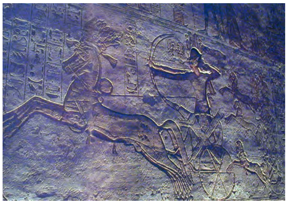
Figure 3. Ramesses II Leads the Counterattack Against the Hittites in the Battle of Kadesh, ca. 1275 BCE. Relief from the Great Temple at Abu Simbel8

Was the "Sea Account" of Exodus written in a style that mocks Egypt's victory at Kadesh? According to Joshua Berman,9 the answer is "yes." He has argued that the Bible's oldest version of the story of the Israelites' final escape from the Egyptians,10 like the story of the ten plagues highlighted in a previous article in this series, was written as a sort of parody. Unlike more common sorts of parodies, the imitation was not intended for comic effect.11 Rather, if Berman's arguments hold, the purpose of the imitation may have been to highlight the contrast between the leaders of Egypt and Israel, undermining the supposed supremacy of pharaoh and his gods and showing how the God of Israel, at every turn of events, can be seen as shattering false Egyptian pretensions while revealing Jehovah's true greatness and glory. Specifically, whereas monumental accounts of the battle of Kadesh portray Ramesses II as a godlike figure leading a counterattack against the Hittites, the book of Exodus turns the table mockingly on the Egyptians by describing the Israelites' divinely led victory against them using similar descriptions.