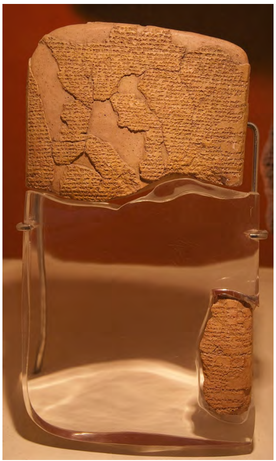
Figure 1. Smaller Tablet of the Hittite version of a Peace Treaty with Egypt, executed ca. 1259 BCE, sixteen years after the battle of Kadesh. It "is believed to be the earliest example of any written international agreement of any kind."2

An Old Testament KnoWhy1 relating to the reading assignment for Gospel Doctrine Lesson 13: Bondage, Passover, and Exodus (Exodus 1-3; 5-6; 11-14) (JBOTL013C)